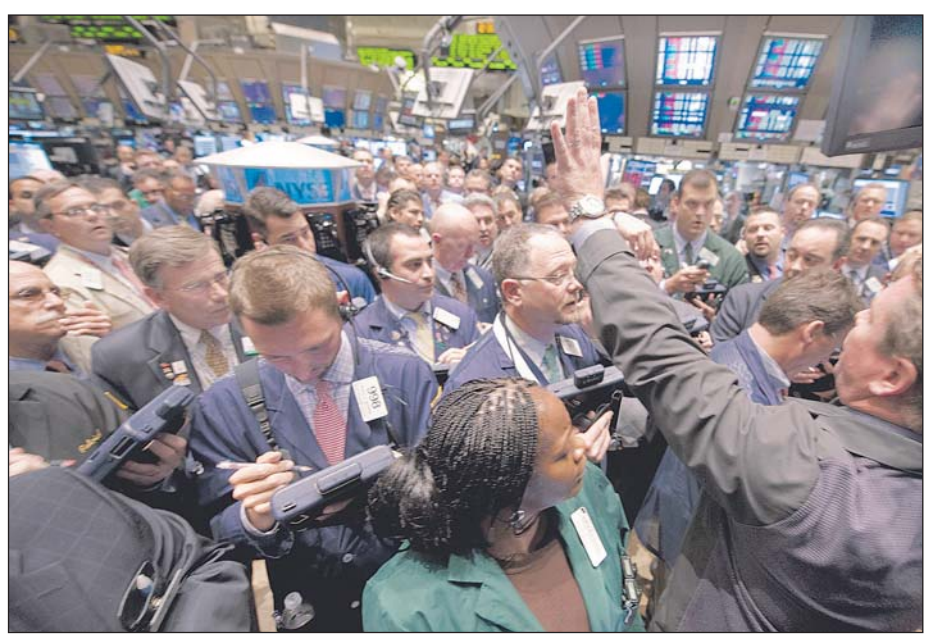
ON THE FLOOR: Traders on the floor of the New York Stock Exchange crowd the post that trades Wachovia as the stock is finally opened, Monday afternoon. Fear swept across the financial markets Monday, sending the Dow Jones industrials down 777.68 points after the government's financial bailout package failed the House.