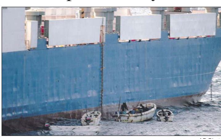
HIJACKED: In this picture released by U.S. Navy on Sunday, Somali pirates in small boats are seen alongside the hijacked "Faina."

NAIROBI, Kenya (AP) — U.S. helicopters on Monday buzzed a hijacked Ukrainian cargo ship carrying 33 Soviet-designed tanks and other weapons that officials fear could end up in the hands of al-Qaida-linked militants in Somalia if the pirates are allowed to escape. Thursday's seizure of the MV Faina off Somalia, a failed state seen as a key battleground in the war on terrorism, could bring dangerous effects across the Horn of Africa and the Gulf of Aden, one of the world's busiest shipping lanes. Piracy has become a lucrative criminal racket in impoverished